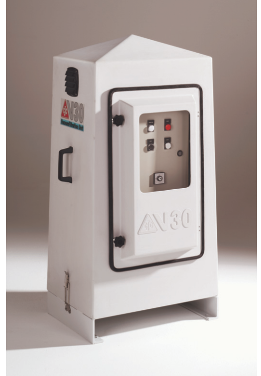
CJC™ V30 Vacuum Filter Unit

The gas content was reduced during the first 24 weeks of degassing treatment. One example is the oxygen content, which was reduced by more than 80 % - from 16.400 ppm to less than 3.000 ppm. This will extend the life expectancy of the transformer .